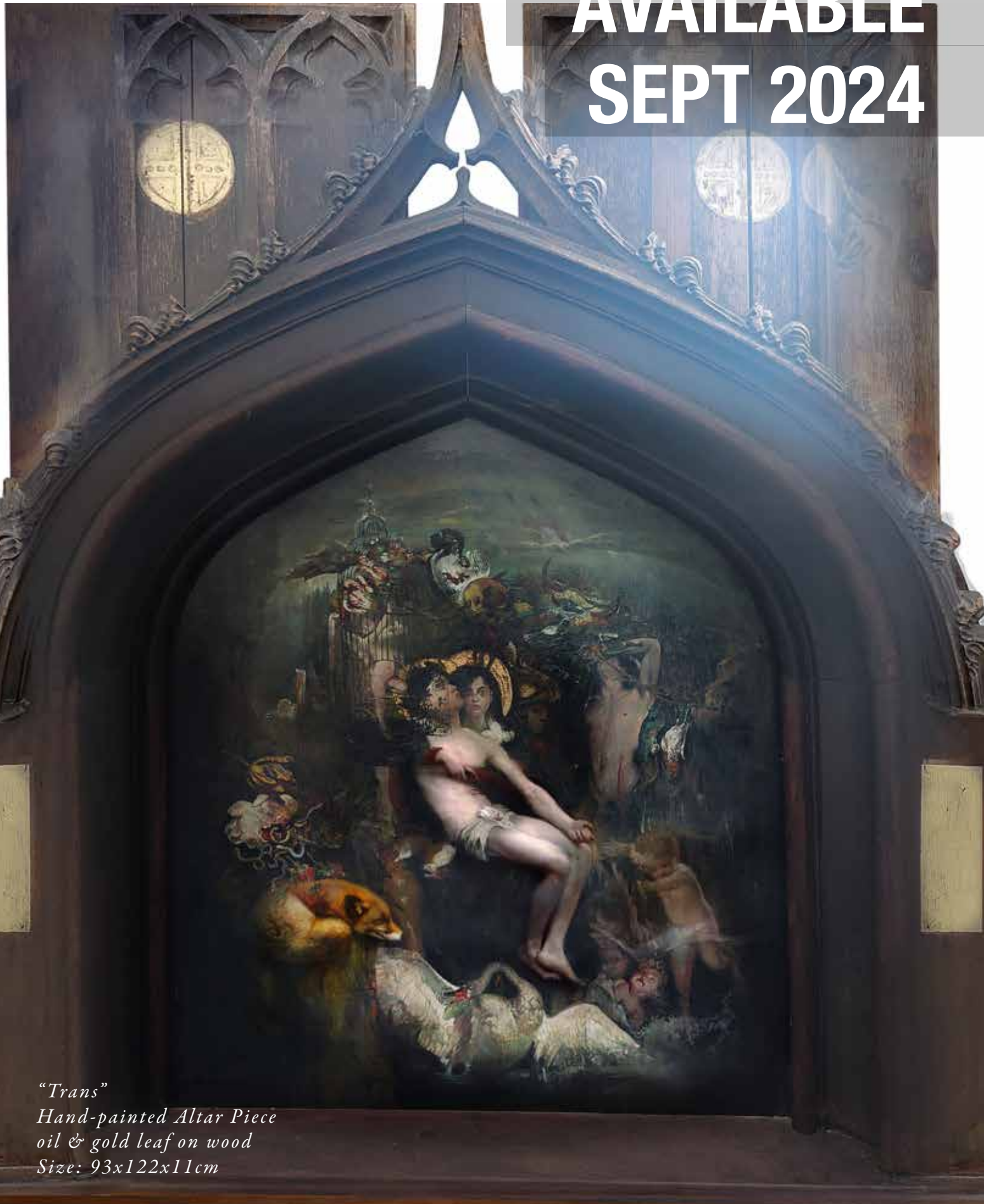
"Trans" Hand-painted Altar Piece oil & gold leaf on wood Size: 93x122x11cm