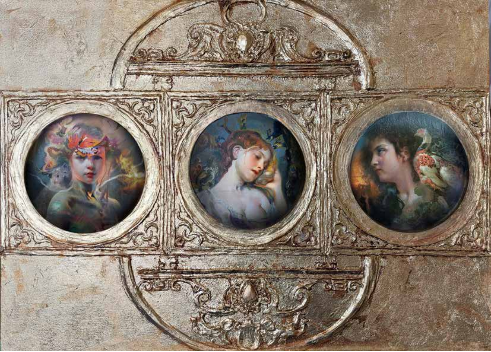
"Tales Of The Burning Sea" Oil, Modeling Paste & Gold Leaf on Canvas Size: 60x80x3.5cm