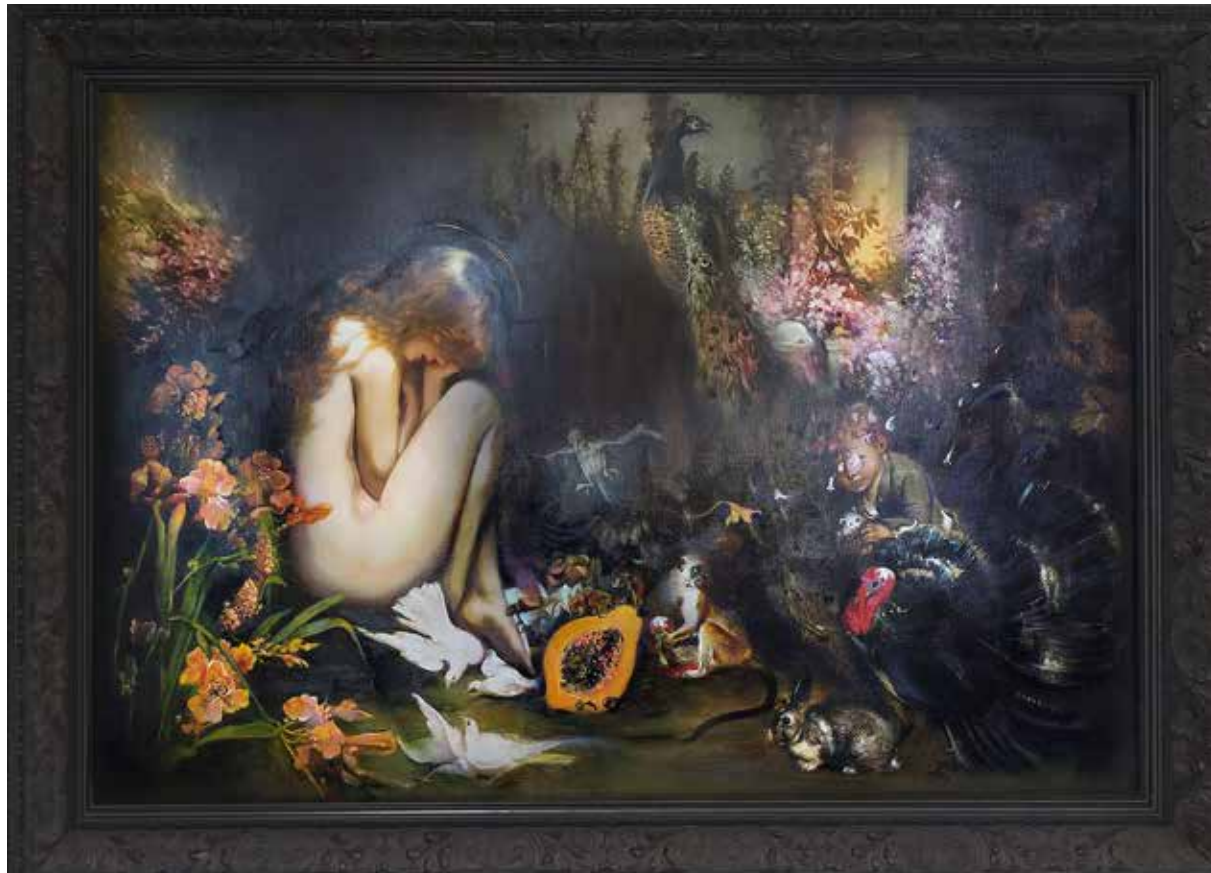
Ornate Dark Charcoal coloured wooden Frame