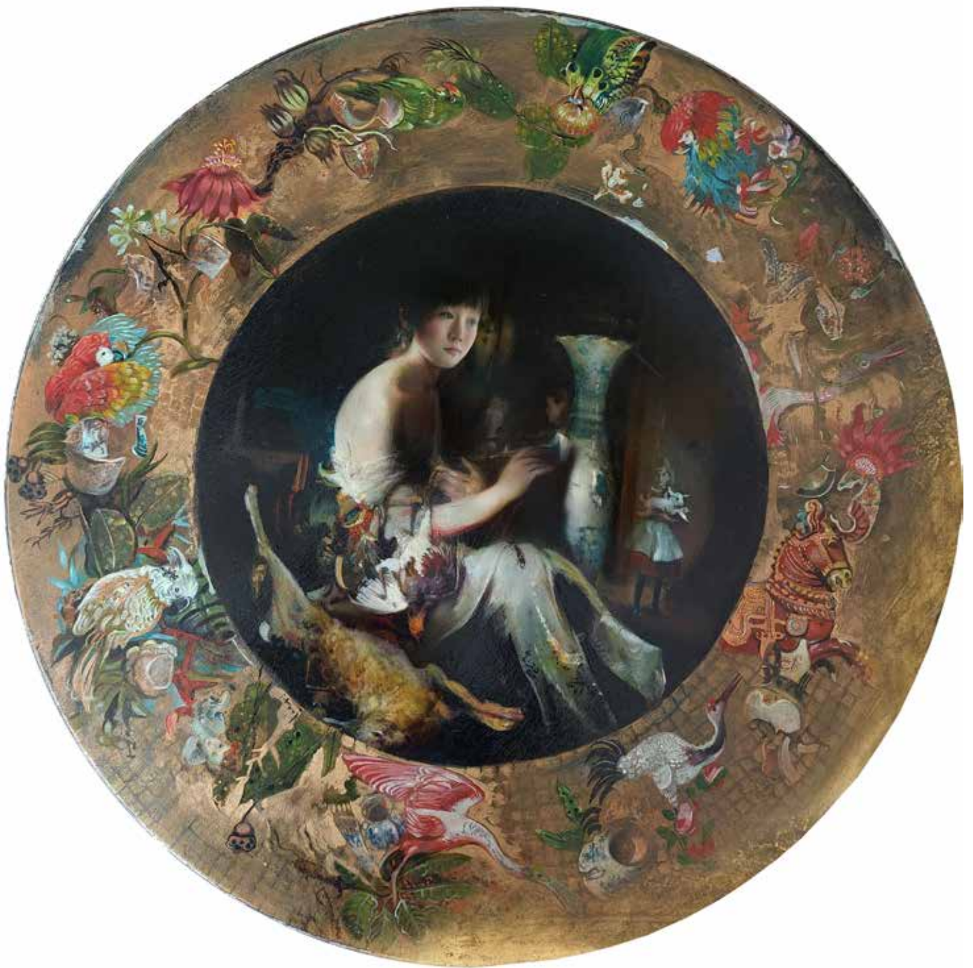
1. "The Painter" Oil, Liquid Bronze & Gold Leaf on Wood Hand-painted top on an wooden Antique Table