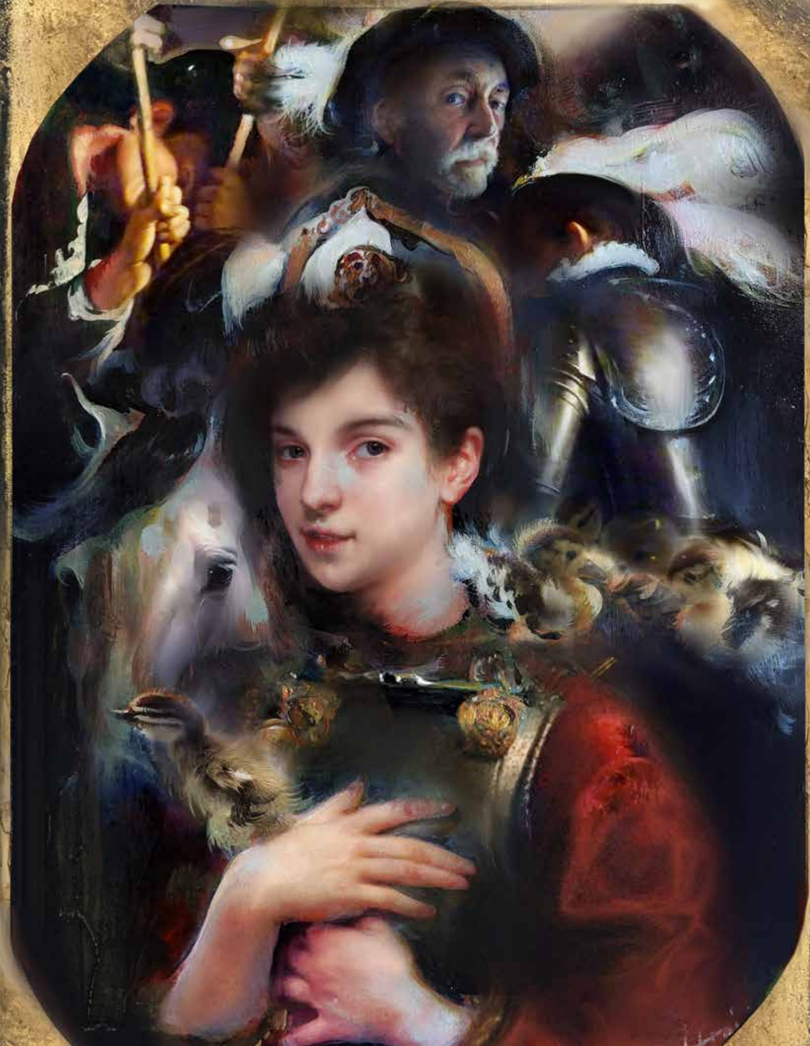
"Defender Of Small Things" Oil, gold leaf, liquid bronze on wood Transparent Oil Technique on pine wood panel