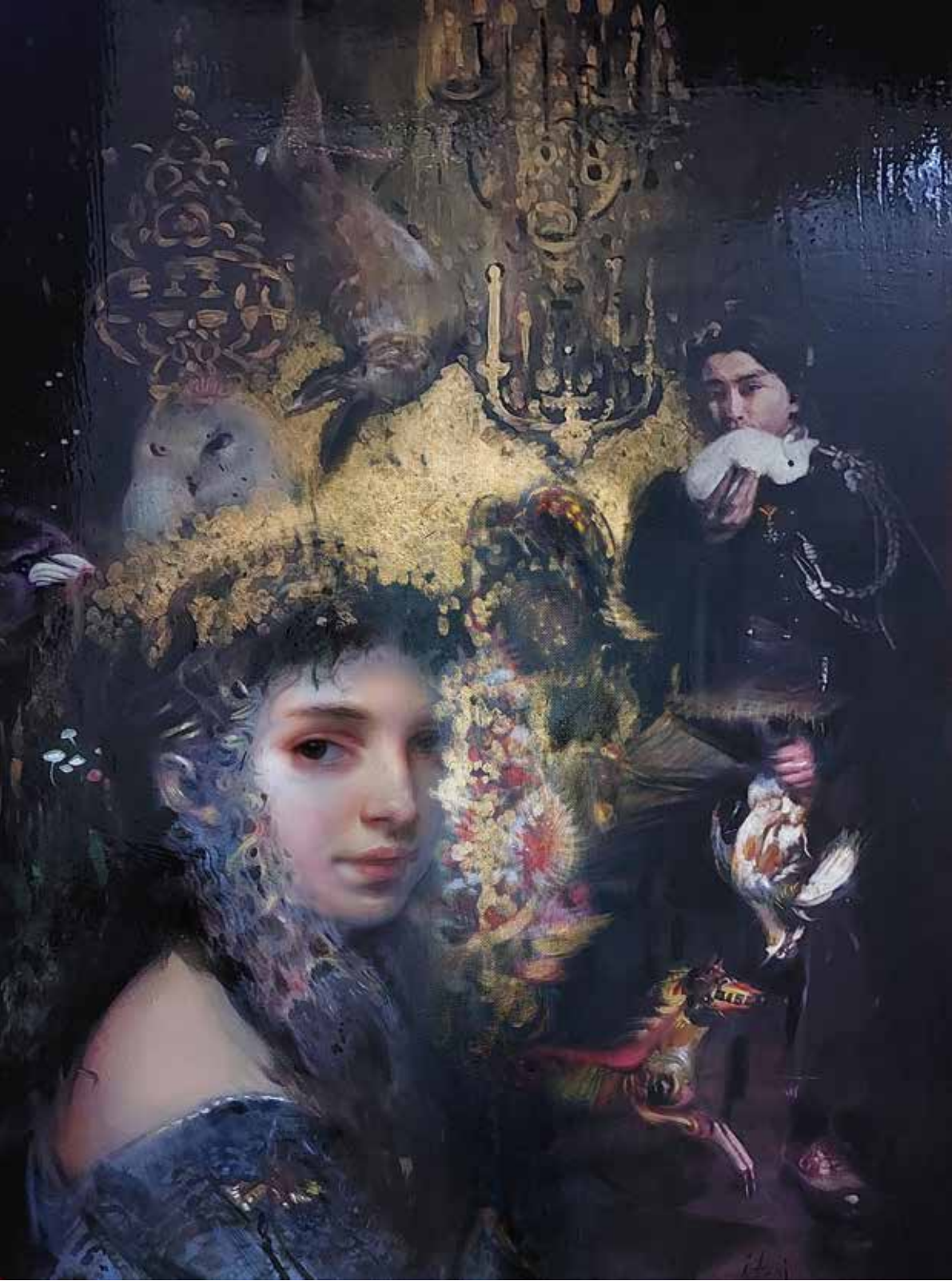
"The Chandelier" Technique: Acrylic, Liquid Bronze on Canvas Size: 62x92cm