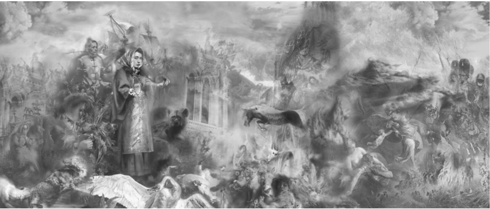
MANKIND II / Pencil on Paper