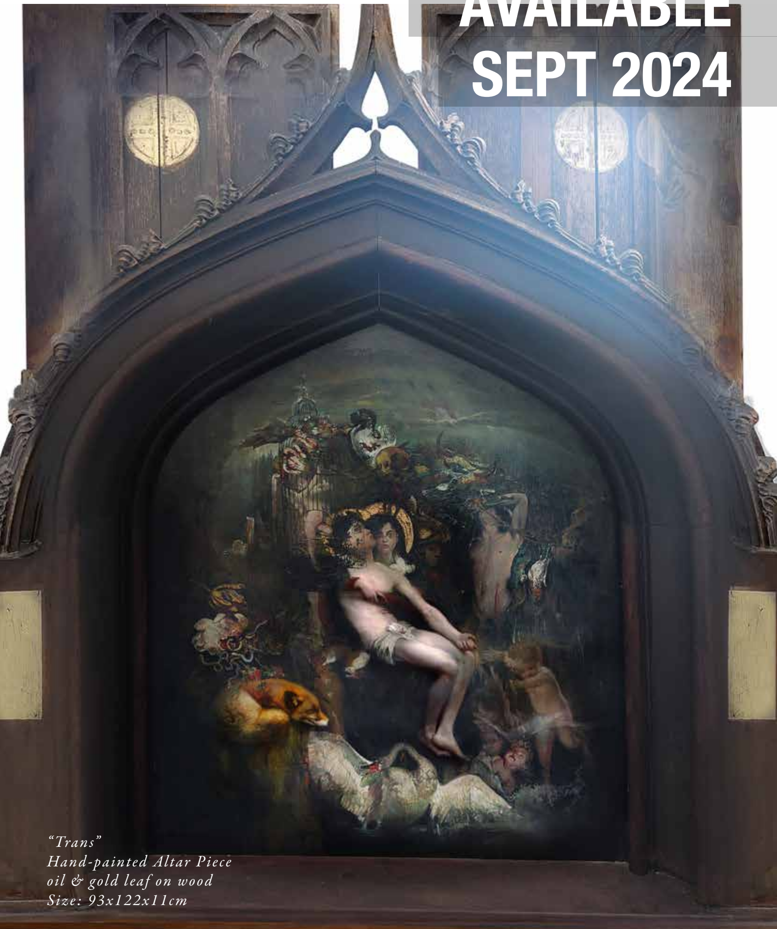
"Trans" Hand-painted Altar Piece oil & gold leaf on wood Size: 93x122x11cm