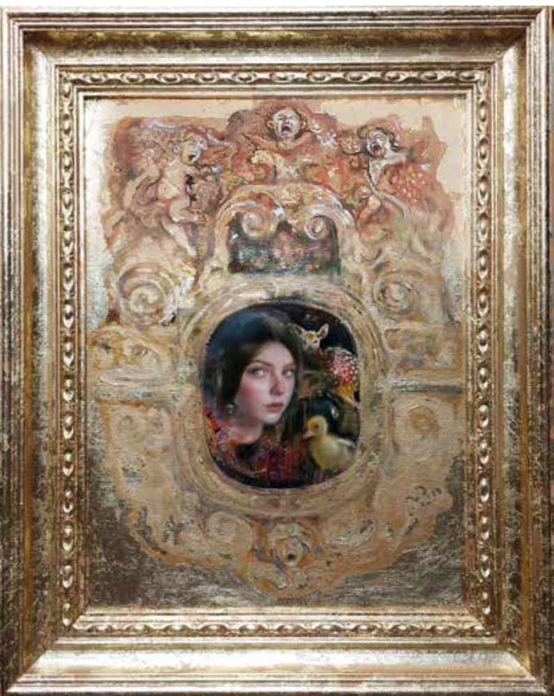
"Dollface II" Oil & Gold Leaf on Canvas & Wood Size: 41x53cm