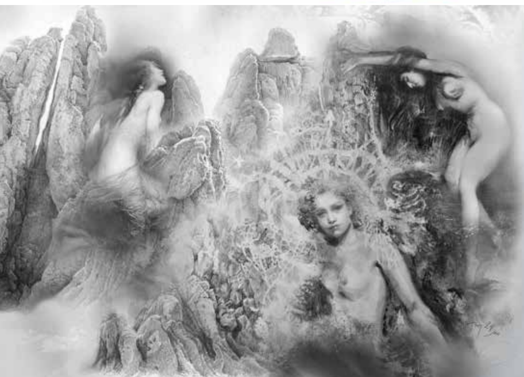
2. "Sea Beast" Drawing: Pencil on Heavy Exeter Papermill Paper