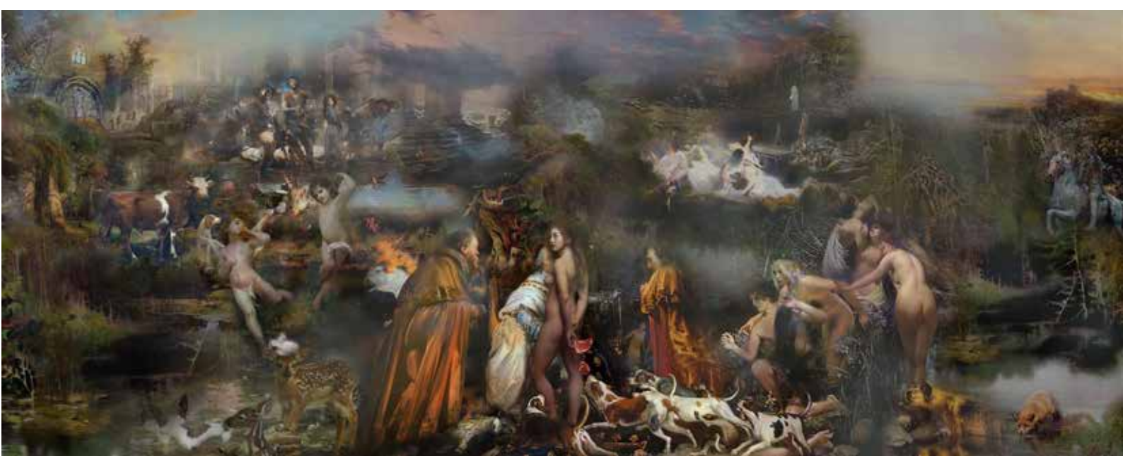
"Barefoot" Hand-finished Ltd Edition large format print acrylic, liquid bronze & gold leaf on Habnemulbe paper Size: 150x62cm [Have only one left and a frame for it]