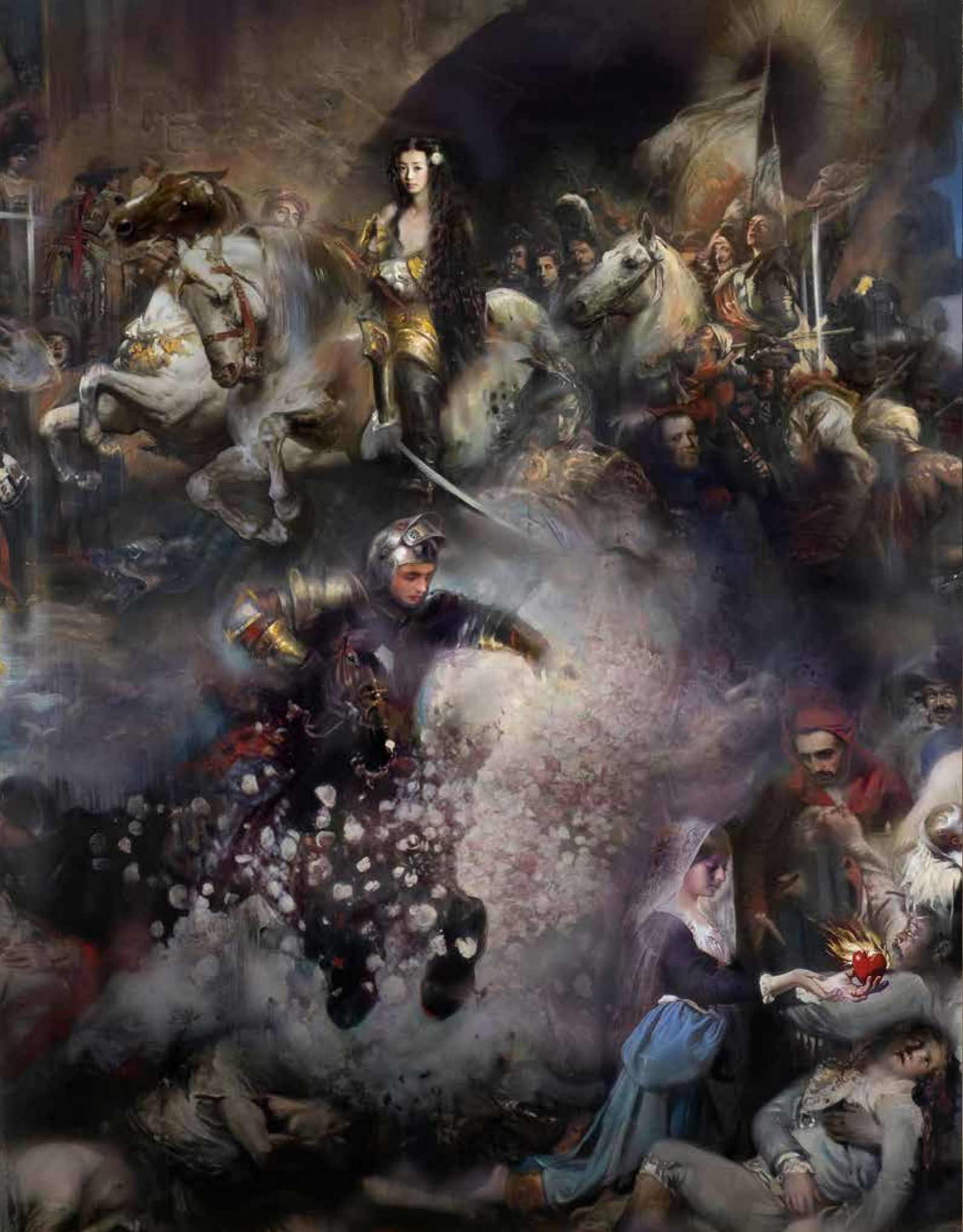
"The Red Painting" oil painting created 2023-24 / detail [on loan to MaxArt Gallery Nevada, USA] Oil on Canvas / Transparent Oil Technique on linen/cotton canvas