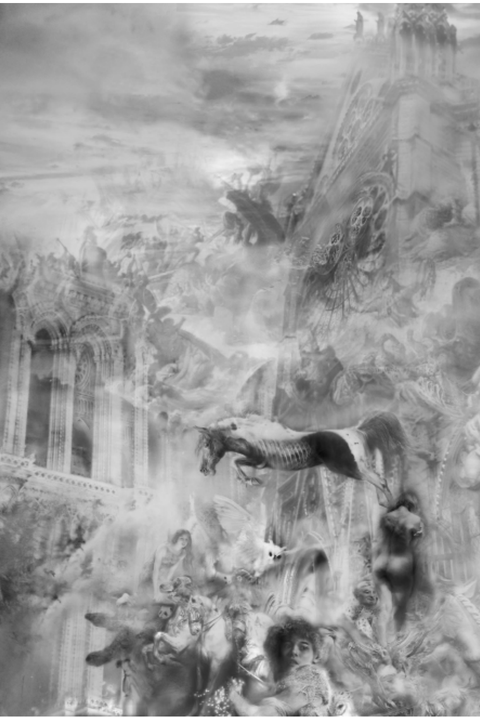
[Right] MANKIND & DETHRONED III DETAIL / Pencil on Paper