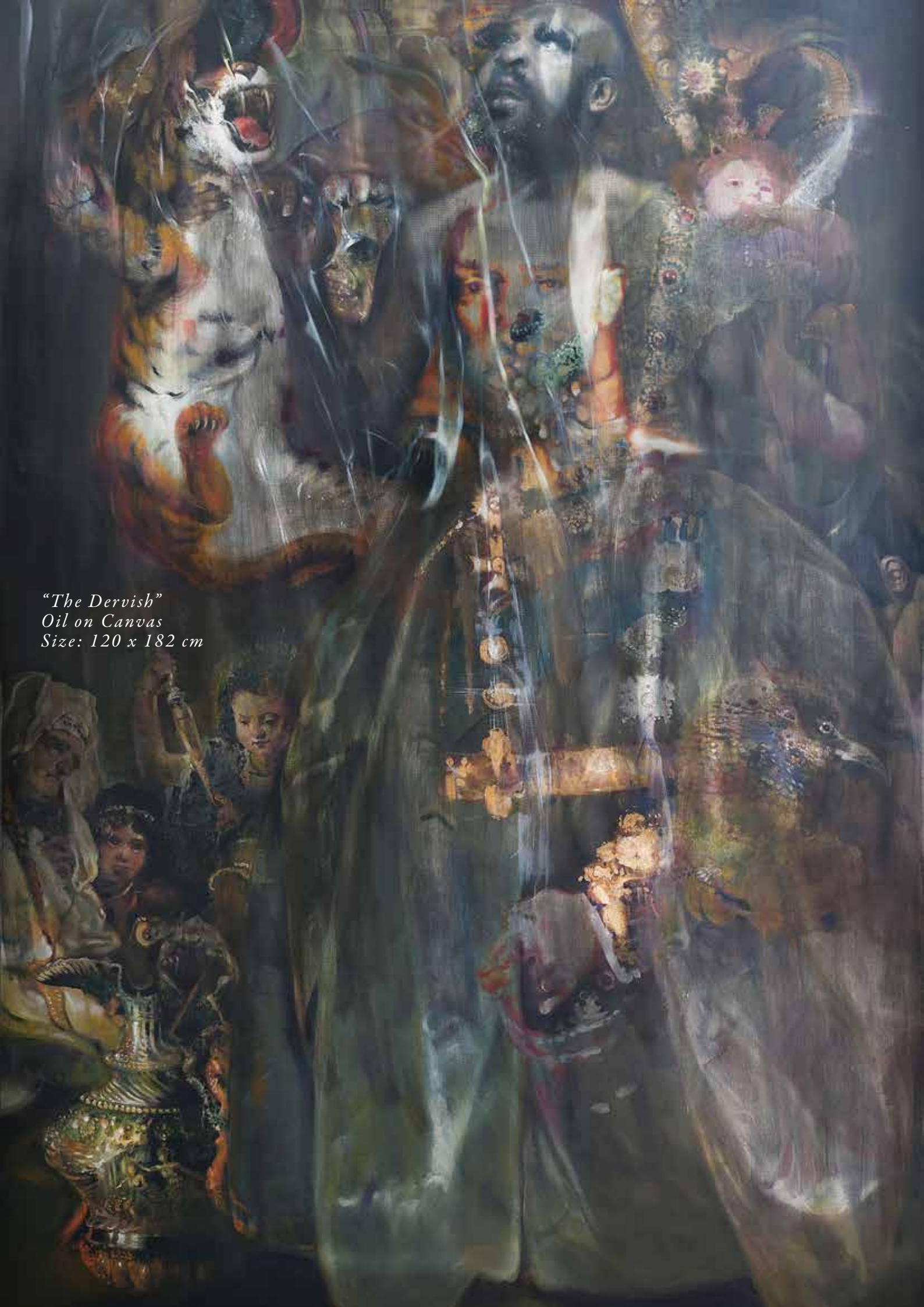
"The Dervish" Oil on Canvas Size: 120 x 182 cm